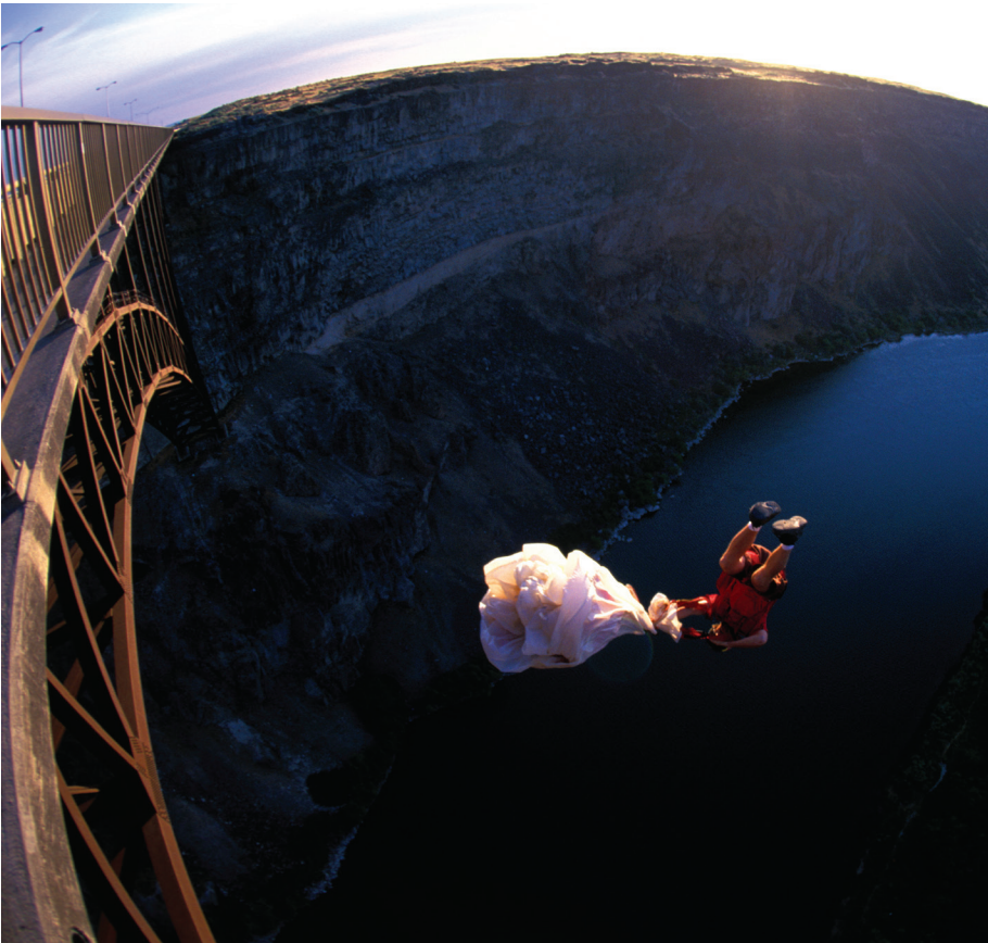
Shane McConkey rolling over a TARD (Totally Awesome Rapid Deployment) at Twin Falls, ID.